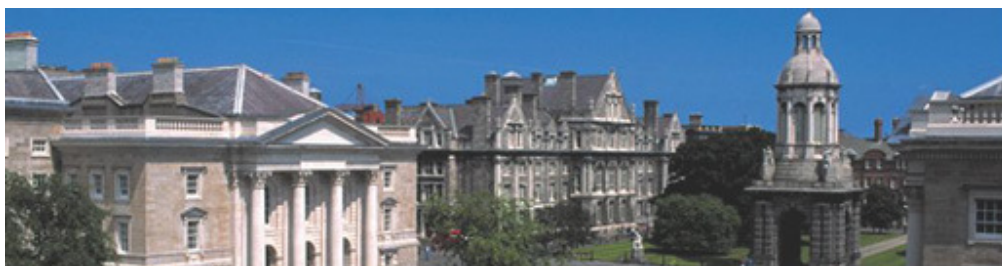
Front Square, Trinity College Dublin

The conference will be held in the Conference Centre of the beautiful city-centre campus of Trinity College Dublin. Please see www.tcd.ie for more information.